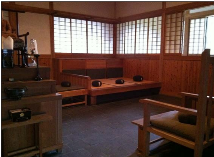
Inside of sodo.