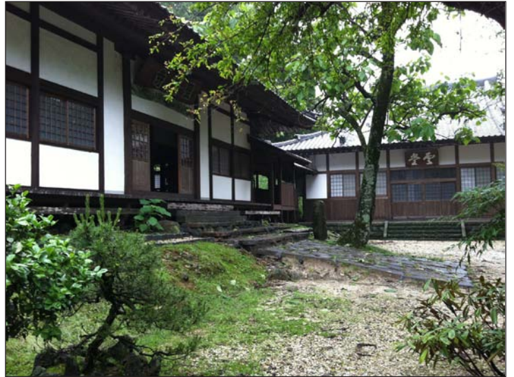
Shogoji Hatto (Dharma Hall, left bldg.) and Sodo (or Undo, Monks' Hall, right bldg.)